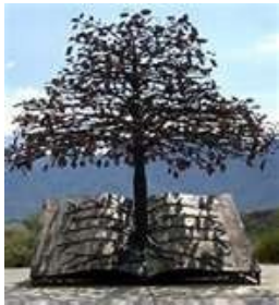
Sharing knowledge using adult participatory learning techniques

We can provide a basic awareness training for your workers with an OSHA 10 hour outreach ; a program designed to benefit all workers. Your safety committees, safety audit teams, supervisors or others with more extensive safety and health responsibilities may be better served with an OSHA 30-hour outreach training program. Either of these programs can be provided in the General Industry or Construction format. Contact the center today for more details.